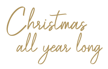
DAY 4 sunday, december 3th of 2023 / sunday, december 10th of 2023

We believe that the principles and values of Christmas should not be remembered only one night a year, but something we should take with us every single day of our lives. Because Christmas is, for us at Malhadinha Nova, more than anything, to give and share with others, and knowing that this is a year where Christmas won't be as happy for many people around the world, we invite you to prepare a little box with a gift from our estate or some essential goods which we will have available, to send to a child or a family suffering from the consequences of conflicts around the world. Our team will be in charge of sending it to help a humanitarian aid association of your choice. We also give you the option to donate the value of your third night to help a humanitarian aid association of your choice.