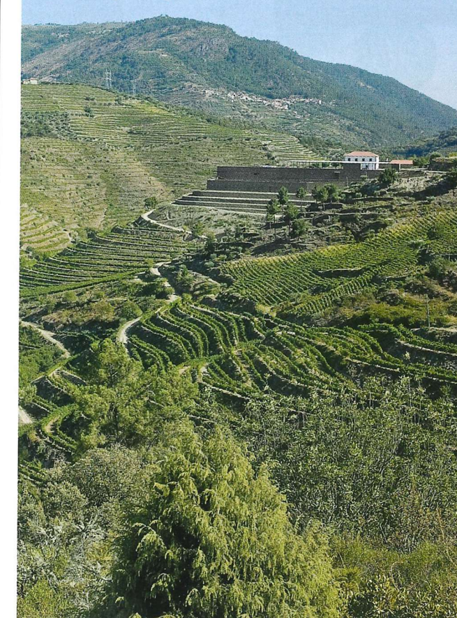
Niepoort's Douro winery Quinta de Nápoles, near Marmelal in the Cima Corgo sub-region