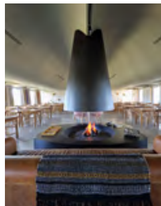
From left: Craveiral Farmhouse's low-slung cottages; the restaurant at Craveiral Farmhouse

Pinto discovered the land for his hotel beneath a 9ha field of carnations ( cravo is the Portuguese word for the flower). The 38 suites and cottages are newly built, yet they easily blend in with the old farmhouses of São Teotónio, with their squat chimneys and tiled roofs. Inside, walls of cork and wood provide a modest backdrop for a handful of modern amenities, such as Hästens mattresses, soaking tubs and minimalist furnishings from Portugal's WeWood atelier. The mini-village also has four swimming pools and a wellness centre.