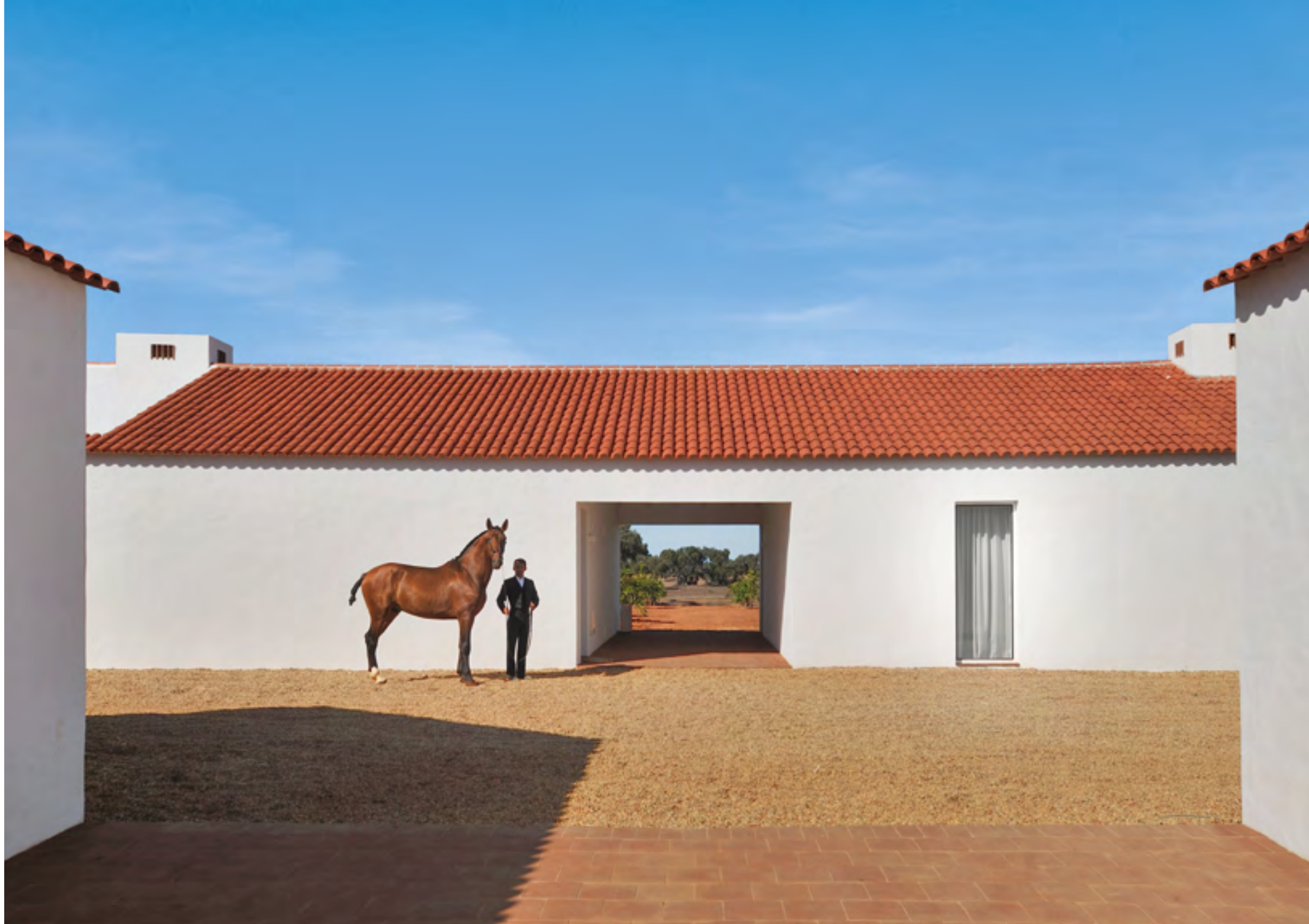
From left: a Lusitano horse at Herdade de Malhadinha Nova; a private place in the sun at Dá Licença